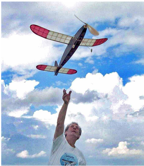
Above: An outdoor endurance model Launch. The model has a wingspan of 36 Inches and uses multiple loops of rubber Strip for power. Below: This is the Squirrel, a beginner's model that's easy and quick to build and is a fine flier. See page 5 for more information on the Squirrel.