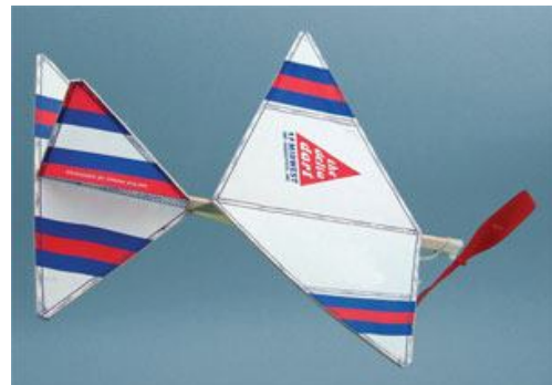
This is the Delta Dart, a.k.a. the AMA Cub. It's an easy-to-build beginner model. See vendor list for more information. The balsa wood framework is glued direct to the plan which become the model's covering after trimming around the outlines.