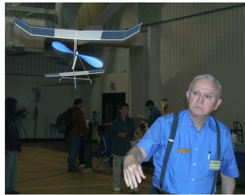
An indoor endurance model is seen just after being launched. This one uses a molded plastic propeller and a solid balsa stick for a fuselage.