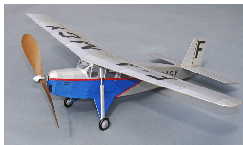
A 24" rubber-powered scale model of a French lightplane.