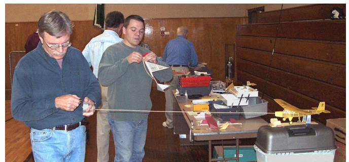
This photo, taken during a typical indoor flying session, shows how the rubber motor of a small scale model is stretched to permit the maximum number of desired turns to be added. The model is anchored securely in a winding "stooge" (see glossary) mounted on the flier's field box. He'll slowly start coming in on the model as he completes the second half of the desired turns, finishing with the front end of the motor just in front of the model's nose. He'll then hook the propeller to the motor, detach the model from the stooge, and be ready to fly. Proper winding technique is important for optimum flight performance and duration.